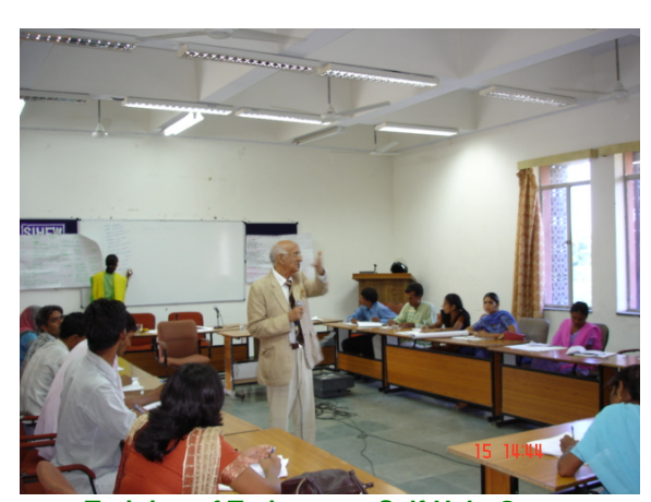
Training of Trainers on Self Help Group

Within BOCAM-R project, four field-based training programmes has been organized on themes related to initiation of mFI, MIS and developing perspective microfinance These programmes. programmes have benefited functionaries from 8 partner NGOs.