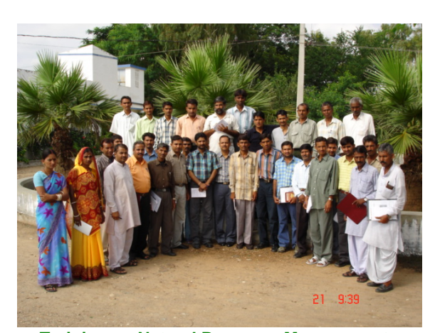
Training on Natural Resource Management

Handholding support as an integral component for capacity building has been continued during the year